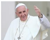
Angelus, Rome January 1, 2022

Looking at Mary with her Son in her arms, I think of young mothers and their children fleeing wars and famine or waiting in refugee camps. They are many!....If we become artisans of fraternity, we will be able to mend the threads of a world torn apart by war and violence..