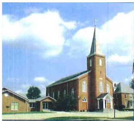
St. Maurice Napoleon

Three unique parishes joined in mutual support to live and spread the gospel, provide enhanced worship opportunities, further faith formation, welcome and reach out in love to those in need. (Cohort Mission Statement)