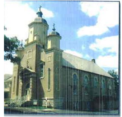
St. John the Baptist Osgood