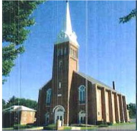
Immaculate Conception Millhousesen