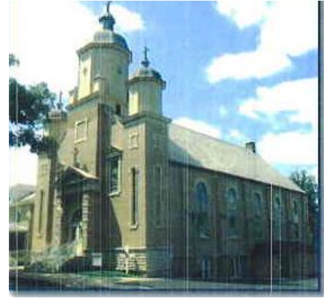
St. John the Baptist Osgood