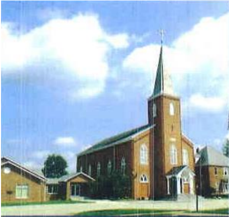
St. Maurice Napoleon

Three unique parishes joined in mutual support to live and spread the gospel, provide enhanced worship opportunities, further faith formation, welcome and reach out in love to those in need. (Cohort Mission Statement)