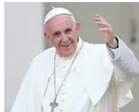
Angelus, Rome February 16, 2020

By accepting the Law of God in our heart, one understands that, when one does not love one’s neighbor, to some extent one kills oneself and others, because hatred, rivalry and division kill the fraternal charity that is the basis of interpersonal relationships. And this applies to what I have said about war and also about gossip, because words kill.