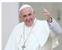
Holy Bari February 23, 2020

Love your enemies and pray for those who persecute you. This is the Christian innovation. It is the Christian difference. Pray and love: this is what we must do, and not only with regard to those who love us, not only with regard to our friends or our own people. The love of Jesus knows no boundaries or barriers.