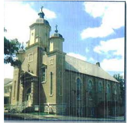
St. John the Baptist Osgood