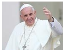
Angelus, Rome March 8, 2020

We have not seen with our own eyes the face of Jesus shining like the sun. However, we too were given the Word of Salvation, faith was given to us, and we have experienced the joy of meeting Jesus in different ways. Jesus also says to us. “Rise and have no fear”. (Matthew 17:7)