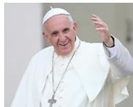
Angelus, Rome March 6, 2022

Please; No dialogue with the devil! We must not enter into dialogue with temptation, we must not fall into that slumber of the conscience that makes us say: “But after all, it is not serious, everyone does it!” Let us look at Jesus, who does not seek compromises, he does not make agreements with evil.