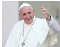
Angelus, Rome March 15, 2020

Like the Samaritan woman, whoever personally encounters the living Jesus feels the need to talk about him to others, so that everyone might reach the point of proclaiming that, Jesus “is truly the savior of the world”, as the woman’s fellow townspeople later said....We too are called to witness the life and hope that are within us.