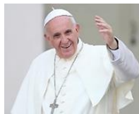
Homily, Rome April 6, 2014

I invite you to think for a moment, in silence, here: Where is my interior necrosis? Where is the dead part of my soul? Where is my tomb?....And to remove the stone, to take away the stone of shame and allow the Lord to say to us, as he said to Lazarus. “Come out!”