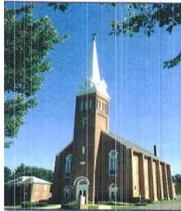
Immaculate Conception Millhousesen