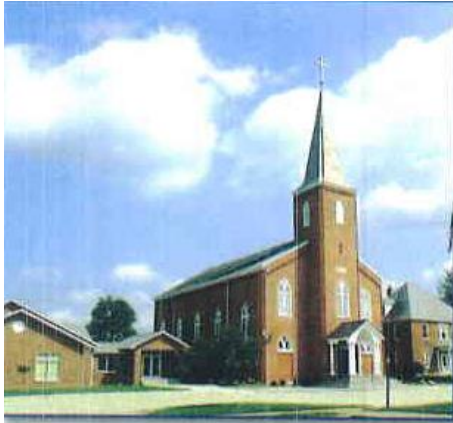
St. Maurice Napoleon

Three unique parishes joined in mutual support to live and spread the gospel, provide enhanced worship opportunities, further faith formation, welcome and reach out in love to those in need. (Cohort Mission Statement)