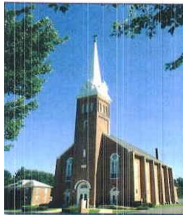
Immaculate Conception Millhouses