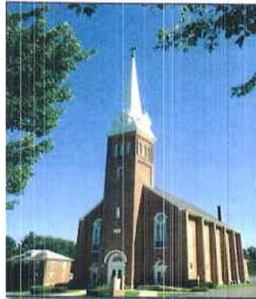
Immaculate Conception Millhouses