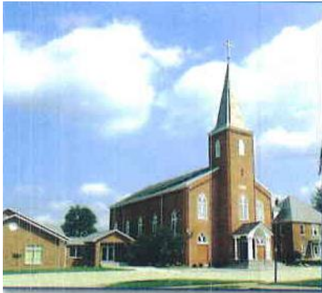
St. Maurice Napoleon

Three unique parishes joined in mutual support to live and spread the gospel, provide enhanced worship opportunities, further faith formation, welcome and reach out in love to those in need. (Cohort Mission Statement)