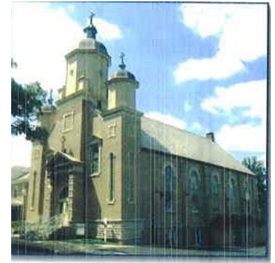
St. John the Baptist Osgood