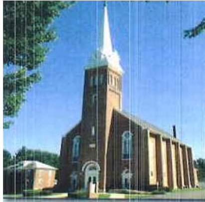
Immaculate Conception Millhousesen