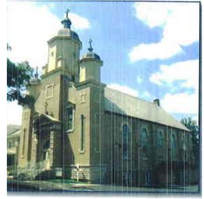
St. John the Baptist Osgood