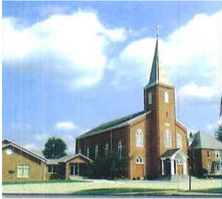
St. Maurice Napoleon

Three unique parishes joined in mutual support to live and spread the gospel, provide enhanced worship opportunities, further faith formation, welcome and reach out in love to those in need. (Cohort Mission Statement)