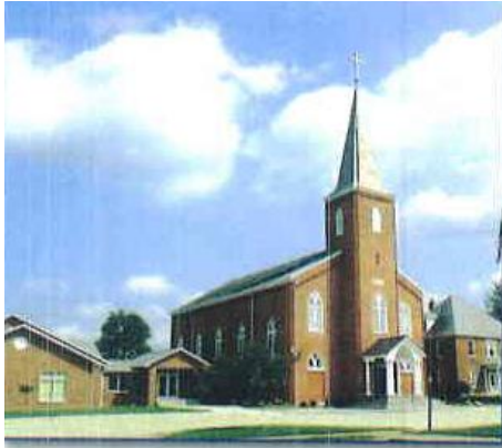
St. Maurice Napoleon

Three unique parishes joined in mutual support to live and spread the gospel, provide enhanced worship opportunities, further faith formation, welcome and reach out in love to those in need. (Cohort Mission Statement)