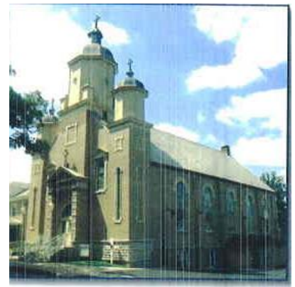
St. John the Baptist Osgood