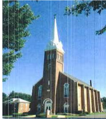
Immaculate Conception Millhousesen