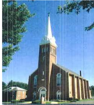
Immaculate Conception Millhouses