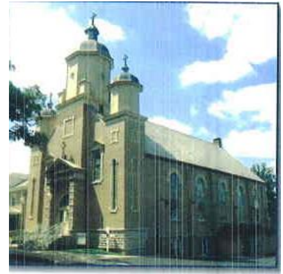
St. John the Baptist Osgood