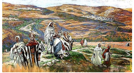
Bringing Home the Word June 2022

Please, now, send us out with no sack, no sandals, no moneybags, yet with wealth beyond all telling: your grace and your love for your poor.