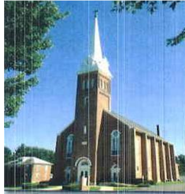
Immaculate Conception Millhousesen