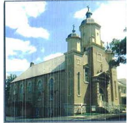
St. John the Baptist Osgood