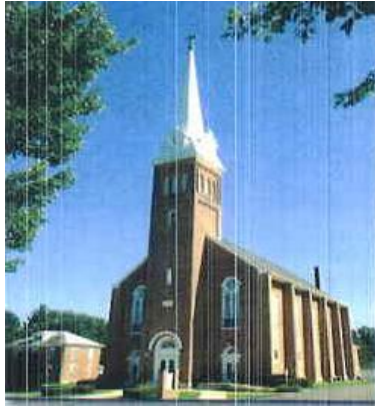
Immaculate Conception Millhousesen