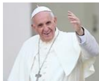
Angelus, Rome, March 17, 2019

Prayer in Christ and in the Holy Spirit transforms the person from the inside and can illuminate others and the surrounding world. How often have we found people who illuminate, who exude light from their eyes, who have that luminous gaze? They pray, and prayer does this: it makes us luminous with the light of the Holy Spirit.