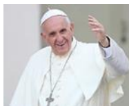
General Audience August 22, 2018

Christ took our names upon himself, to the very end, including the evil that is within us....Anyone, in whatever situation...., can invoke the holy name of the Lord, who is faithful and merciful Love. God will never say no to a heart that invokes him sincerely.