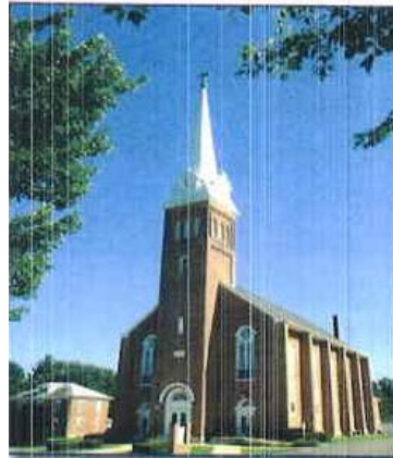
Immaculate Conception Millhouses