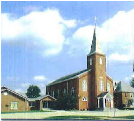
St. Maurice Napoleon

Three unique parishes joined in mutual support to live and spread the gospel, provide enhanced worship opportunities, further faith formation, welcome and reach out in love to those in need. (Cohort Mission Statement)