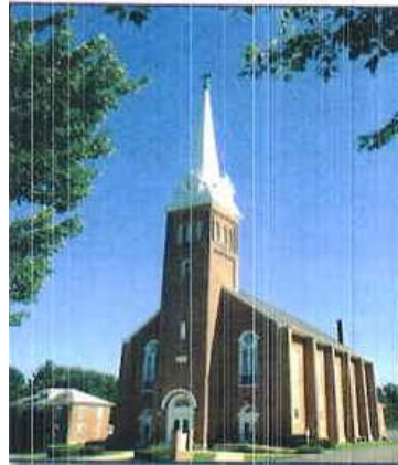
Immaculate Conception Millhousesen