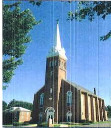
Immaculate Conception Millhouses