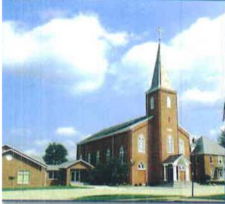
St. Maurice Napoleon

Three unique parishes joined in mutual support to live and spread the gospel, provide enhanced worship opportunities, further faith formation, welcome and reach out in love to those in need. (Cohort Mission Statement)