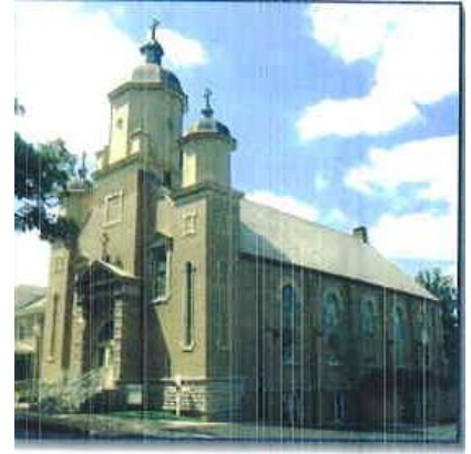
St. John the Baptist Osgood