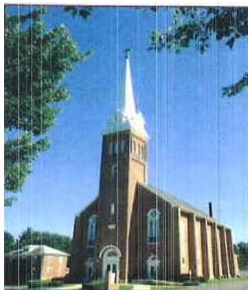
Immaculate Conception Millhouses