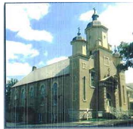
St. John the Baptist Osgood