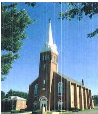
Immaculate Conception Millhouses