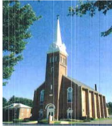
Immaculate Conception Millhouses