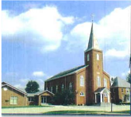
St. Maurice Napoleon

Three unique parishes joined in mutual support to live and spread the gospel, provide enhanced worship opportunities, further faith formation, welcome and reach out in love to those in need. (Cohort Mission Statement)