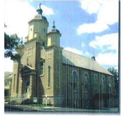
St. John the Baptist Osgood