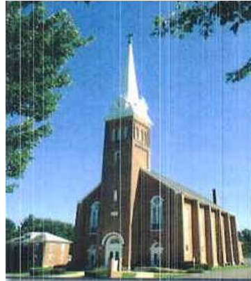
Immaculate Conception Millhouses