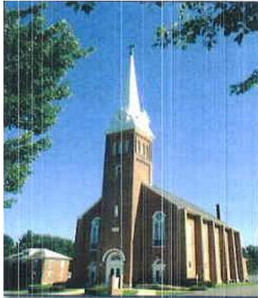
Immaculate Conception Millhouses