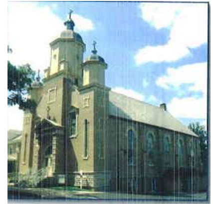
St. John the Baptist Osgood