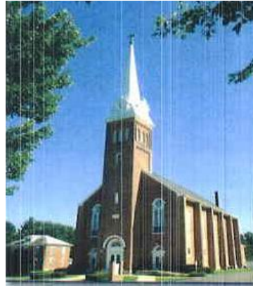
Immaculate Conception Millhousesen