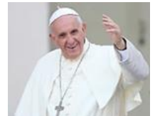
Angelus, Rome November 12, 2017

Here is the meaning of being wise and prudent: it is a matter of not waiting until the last minute of our lives to cooperate with the grace of God....It would be good to consider for a moment; one day will be the last. If it were today, how prepared am I?