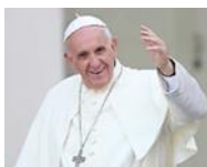
First Sunday of Advent November 29, 2020

Advent is a continuous call to hope, it reminds us that God is present in history to lead it to its ultimate goal, to lead it to its fullness, which is the Lord...God is not distant, he is always with us, to the extent that very often he knocks on the door to our heart.