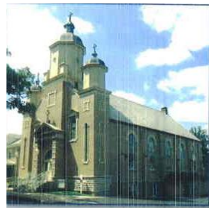
St. John the Baptist Osgood