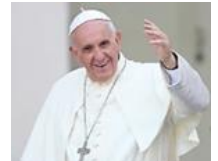
Angeles, Rome December 15, 2019

Advent tells us that it is not enough to believe in God it is necessary to purify our faith everyday. It is a matter of preparing ourselves to welcome not a fairy-tale character, but the God who challenges us...The Child who lives in the manger has the face of our brothers and sisters most in need.