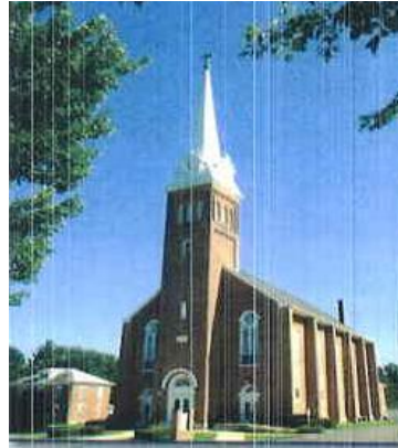
Immaculate Conception Millhouses