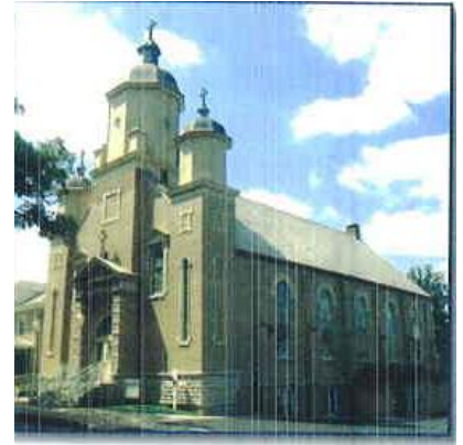
St. John the Baptist Osgood