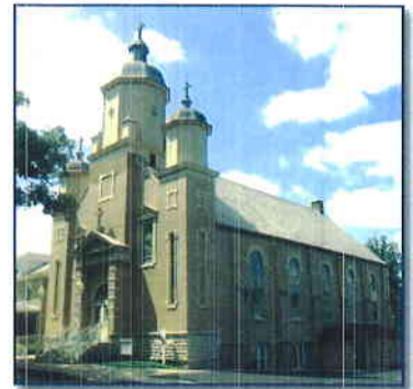
St. John the Baptist Osgood