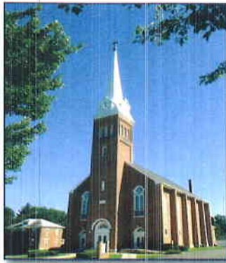
Immaculate Conception Millhousesen