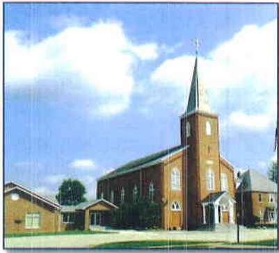
St. Maurice Napoleon

Three unique parishes joined in mutual support to live and spread the gospel, provide enhanced worship opportunities, further faith formation, welcome and reach out in love to those in need. (Cohort Mission Statement)