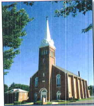
Immaculate Conception Millhousesen