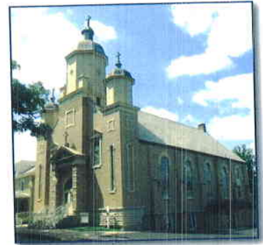
St. John the Baptist Osgood