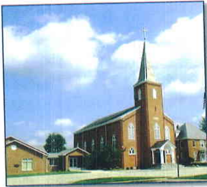
St. Maurice Napoleon

Three unique parishes joined in mutual support to live and spread the gospel, provide enhanced worship opportunities, further faith formation, welcome and reach out in love to those in need. (Cohort Mission Statement)